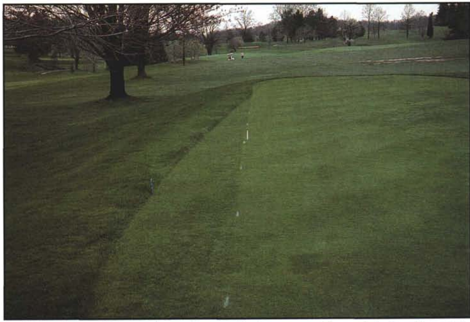
A slight altering of the mowing pattern on the tee can provide much better alignment to the fairway and eliminate the need for costly renovations.

One other agronomic factor that should be examined on championship tees is not related to trees at all. Thatch accumulations on back tees are often extreme. This can be a result of these tees being ignored to some degree from a maintenance standpoint. However, thatch accumulations generally result from the lack of traffic these tees receive. It's ironic that thatch accumulations are usually the worst on the