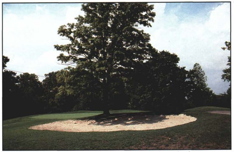
This tree provides a double hazard situation. The location forces the player to hit out of the bunker and negotiate the tree as well. One or the other should be considered for removal.

Placing an obstacle of any kind in the line of play between tee and fairway will generally cause the player to select one side of the tee or the other. For example, if a tree blocks the line of sight to the left side of the hole, shots will generally be played from the right side of the tee box in an effort to avoid interference. This often leads to one side of the tee exhibiting poor turf quality due to high amounts of divots being taken in a very small portion of the tee. Usable teeing space can be