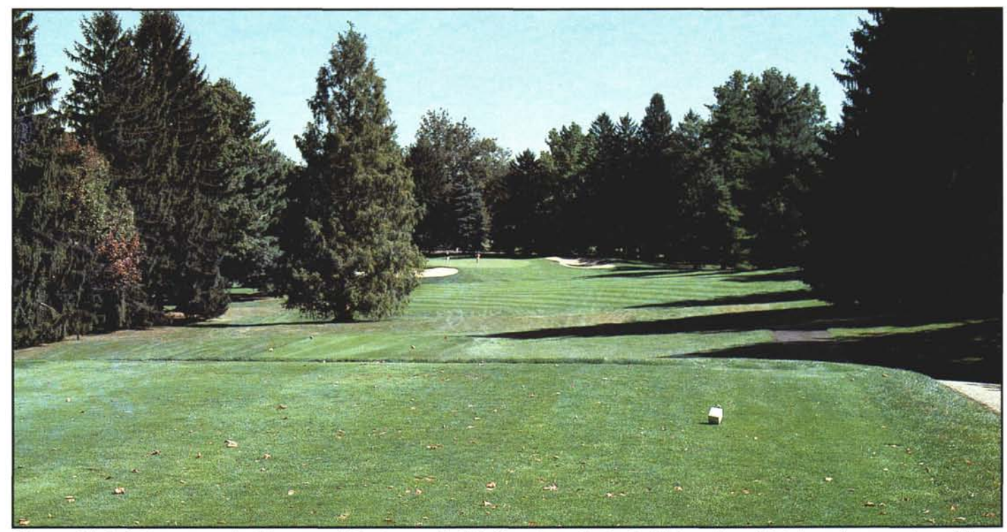
Play on this hole is compromised because of the tree on the left. Even from the back right portion of this tee, a large portion of the green is blocked. The bunker on the left is obscured, and the usable teeing area is reduced.