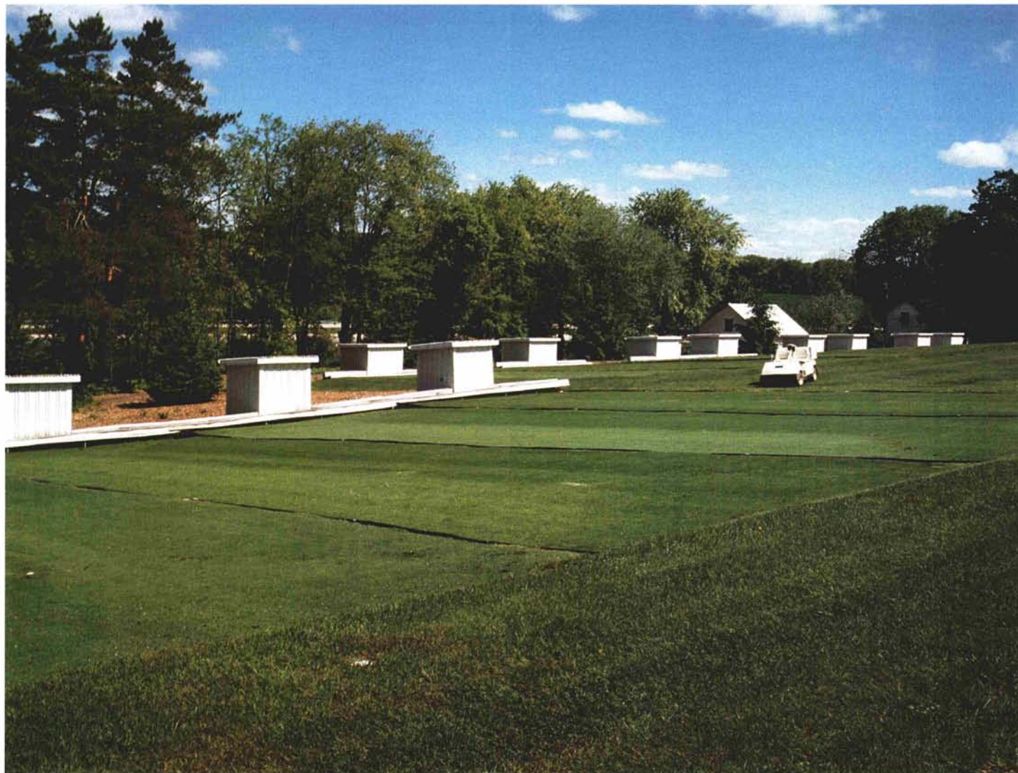
Creeping bentgrass and perennial ryegrass runoff plots.