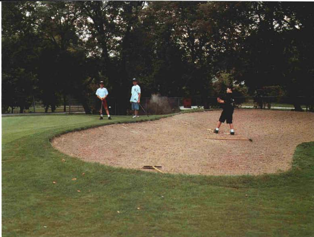
(Top) This youngster has already learned to carry a rake into the bunker with him. The golfers in these programs are often better informed on etiquette and care of the course than their older counterparts. (Left) Sunset Ridge Country Club, Northbrook, Illinois.