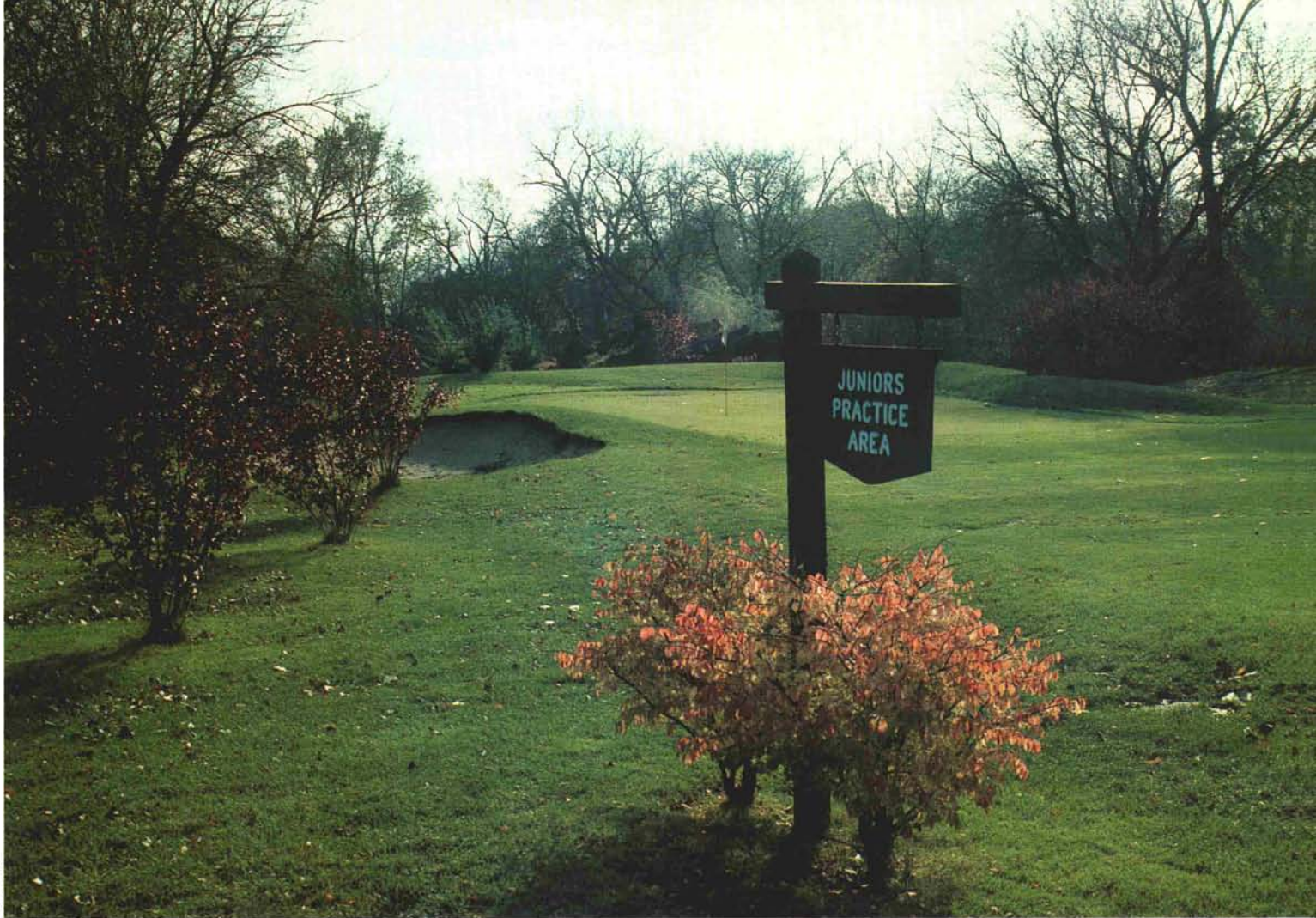
(Above) The Junior Practice Area at Oak Park Country Club receives the same high level of maintenance as the adults' area. This target green, practice bunker, and chipping area are just behind the practice tees. (Right) The target green and bunker are in the foreground, with the practice tee setup and range beyond. This area serves as the skeet range during the non-golf season.