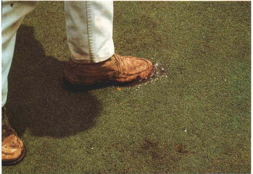
Too much water will cause problems in every aspect of turf management, as well as golf course playability. Proper water management involves both irrigation and drainage.

Discussion of each pitfall could be an article unto itself. However, our intent was