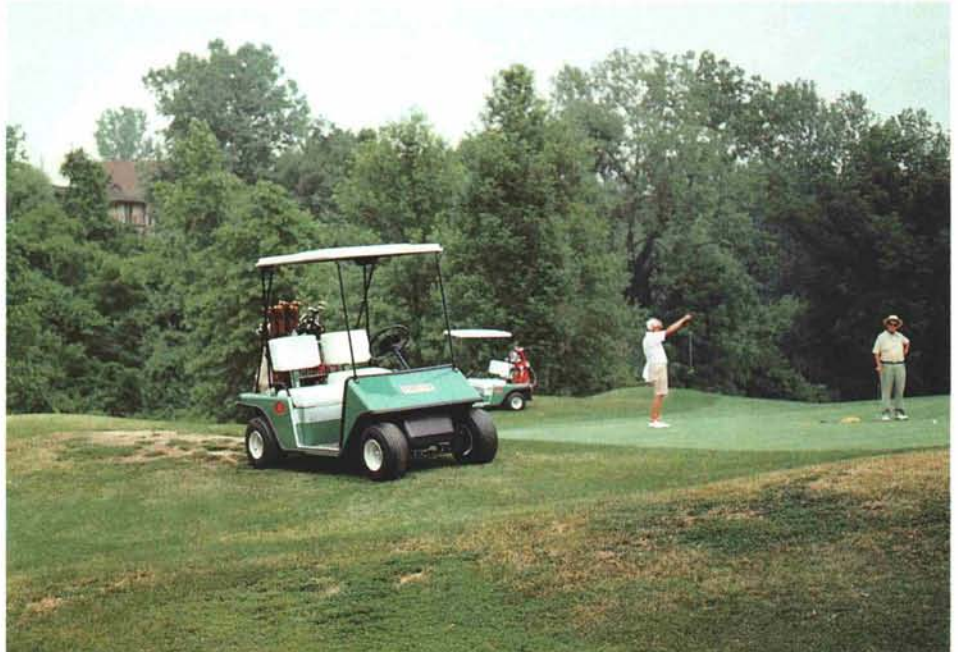
As play continues to increase on most golf courses, controlling golf cart damage becomes more and more difficult.

to identify areas in which improvements can be made to golf course maintenance operations anywhere in the country. As with most aspects of golf course maintenance, these ten pitfalls are interrelated and, as such, success or failure in one area will ripple through the entire program. Every maintenance operation has its strengths and weak-