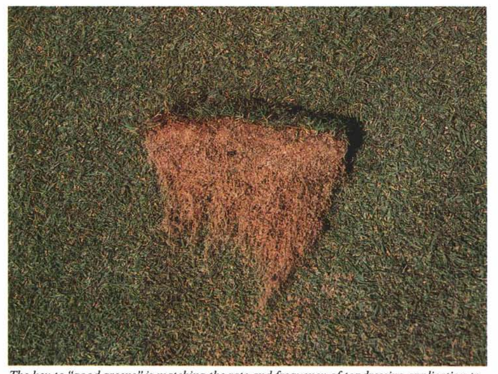
The key to "good greens" is matching the rate and frequency of topdressing application to the growth of the turf. Less-intensive aeration operations are necessary on greens built to USGA recommended specifications when the inputs of fertilizer, topdressing, irrigation, etc. are carefully managed.

Drum aerifiers are simple to use, have few moving parts to wear out or break down, and can cover considerable acreage in a relatively short time. Unfortunately, the depth of penetration is highly dependent on the degree of soil compaction and the moisture content of the