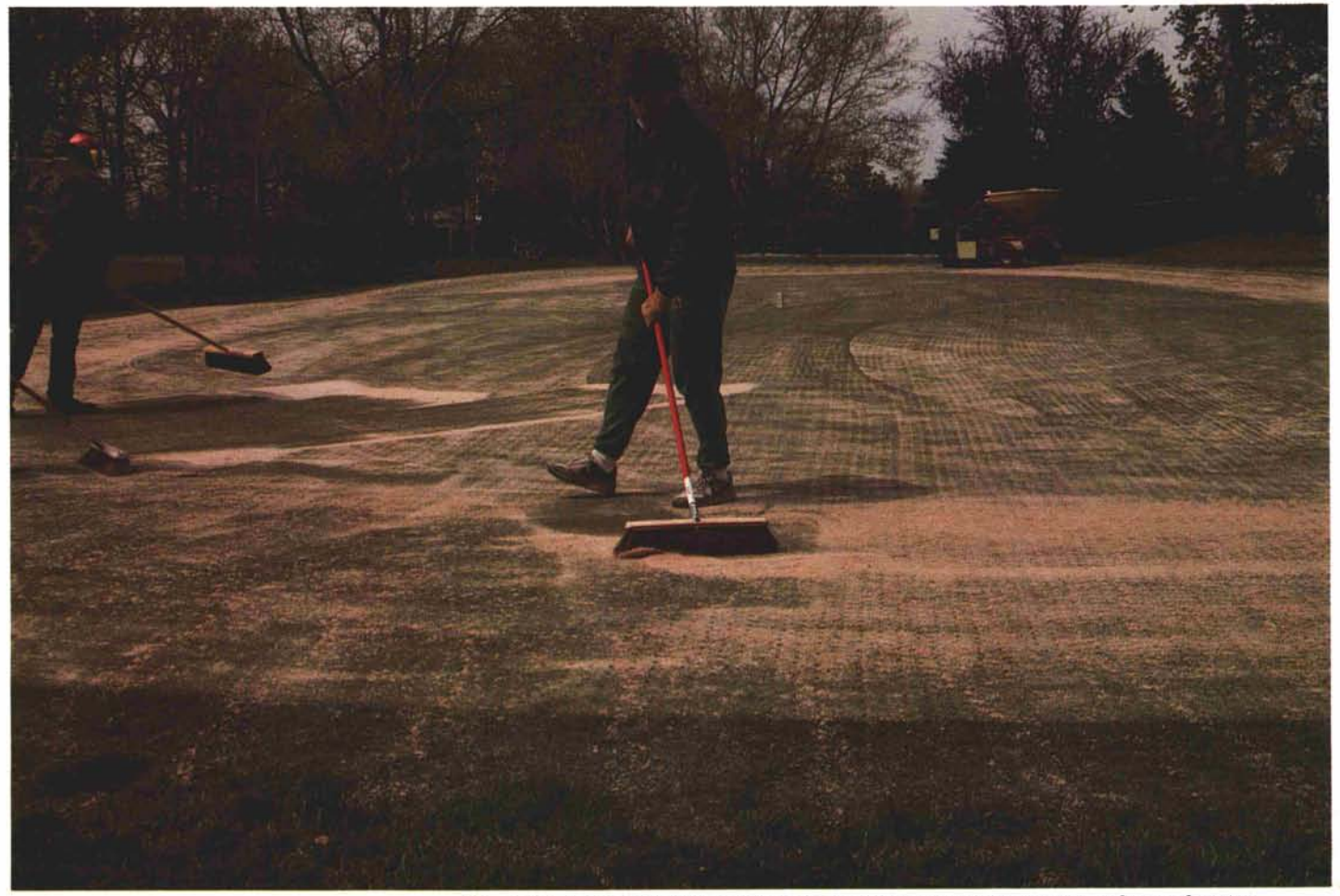
To ensure best results from aerification and topdressing operations, the topdressing must be thoroughly brushed into the aerification holes.