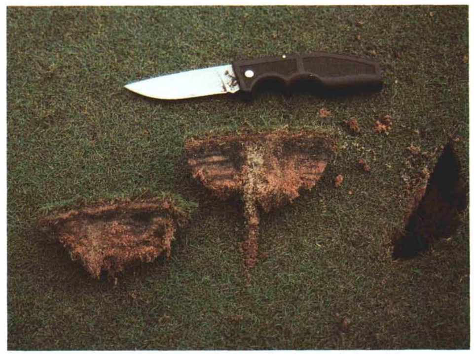
On the other hand, aeration is needed when greens become severely layered due to an excessive accumulation of organic matter that can occur during the "grow in" period or when the greens are topdressed infrequently. Note the "black layer" and the deep penetration of roots through the aeration hole.

soil, and close spacing is sacrificed for speed. If soil conditions are not ideal, these units tend to ride over compacted sites, producing the least effect where penetration is needed the most. The holes can be quite ragged, which limits the use of most drum units on greens. This type of equipment will continue to perform an important task on many low- to moderate-budget courses.