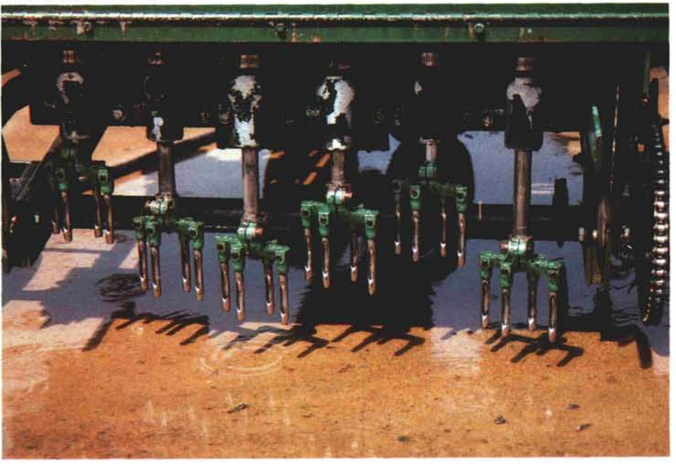
Quadra-tine aeration is an excellent way to improve drainage and "dry out" the turf in a moist, shaded site.

Finally, keep the golfers well informed about when and, more important, why aeration is being performed. Make the extra effort to communicate with golfers and you might be surprised how much support there is for your programs.