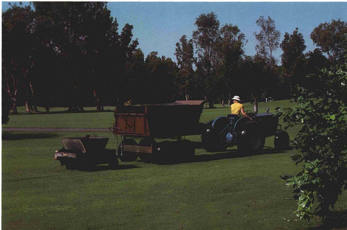
The setup: tractor, trailer, and topdresser at Banyan Golf Club, Florida.