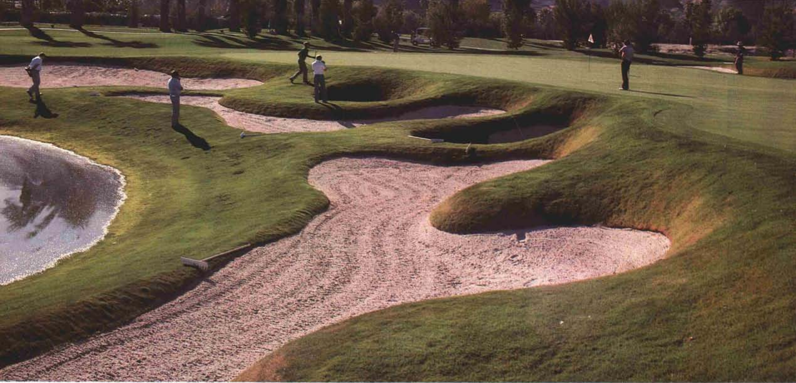
The Club at Morningside, Rancho Mirage, California. A great layout, a solid maintenance program and a beautiful day will ensure rave reviews.