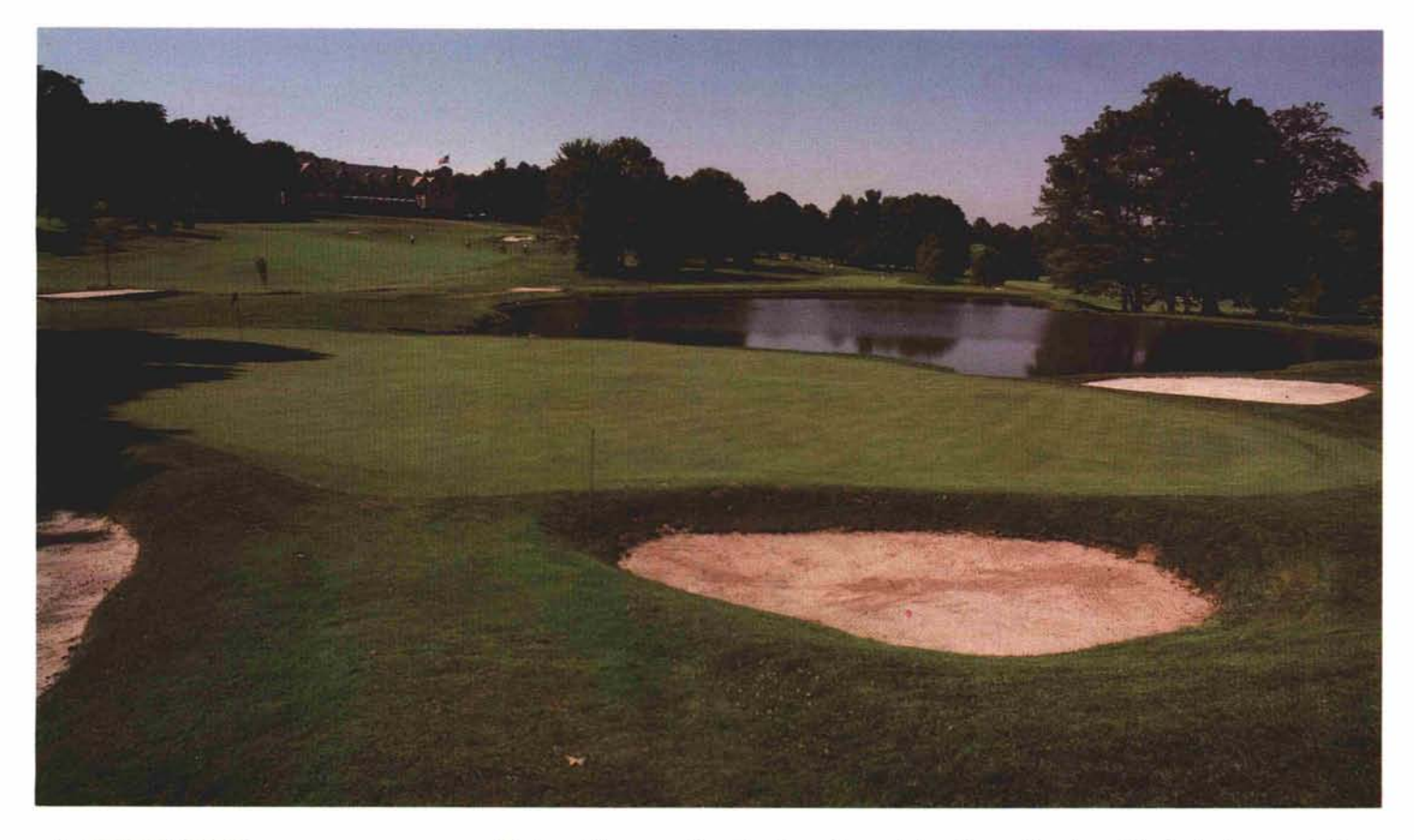
Today, 60 years after the founding of the Green Section, ideal playing conditions are common at thousands of golf courses such as Baltusrol Golf Club.