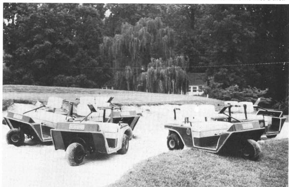
"That'll teach that bunker to make me miss a shot."

The club's professional staff can make a significant contribution to golf by providing leadership for the members in determining what constitutes a good golf course and good playing conditions. They should focus on the individual golfer's talent. They should stress that good course conditioning complements those talents and should not be expected to compensate for a deficiency in them. And then, after all is said and done, that single most exciting and challenging quality of the game will be preserved; "The Rub of The Green."