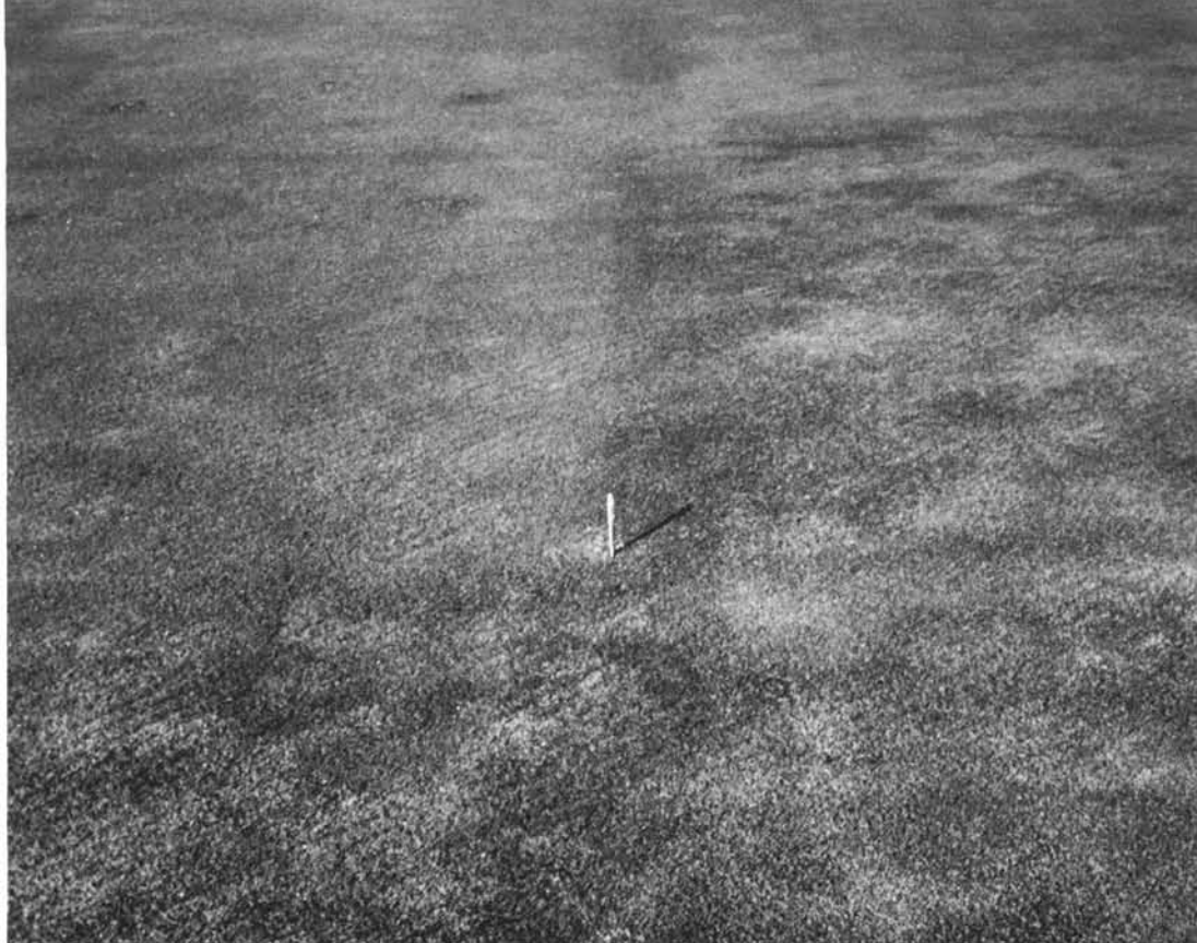
Effect of early May drying on the Virginia Tech experimental green. The plot (on right) containing 80 per cent coarse to medium sand has smaller water porosity than the plot containing 50 per cent coarse to medium sand (on left). These soils require different water managements.

nitrogen fertilization stimulates root development but also increases winter desiccation of creeping bentgrass. This increase of desiccation, however, may be offset with iron fertilization. Therefore, in this area we are better able to withstand summer droughts when fertilization is properly managed to develop deep root systems.