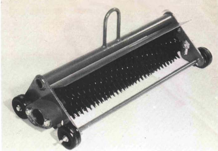
The Toro vertical mower.