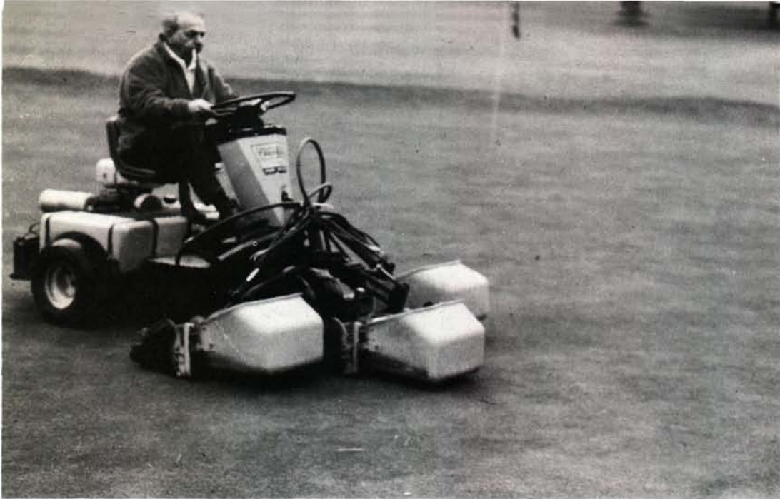
Joe Sirianni, Supt. mowing the Olympic Club's 16th green with a Hahn West Point.

waiting for the day when the triplex putting green mower will vacuum grass clippings (and Poa annua seed) while mowing greens, and then discharge the load automatically on the way to the next green. The mower could also be rigged to apply small amounts of fertilizer, fungicide or insecticide (wet or dry) during the mowing operation. What a labor saver it will be!