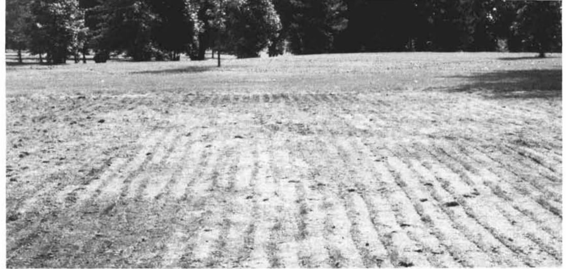
Figure 2. Strip sodding at four-inch intervals.