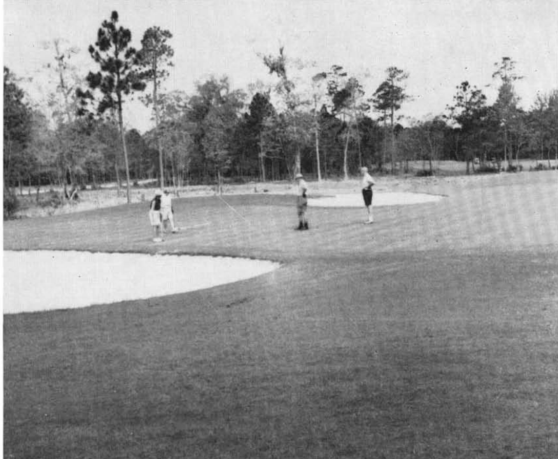
Most golfers like the deeper green color of Tifdwarf but must adjust to the faster putting surface.