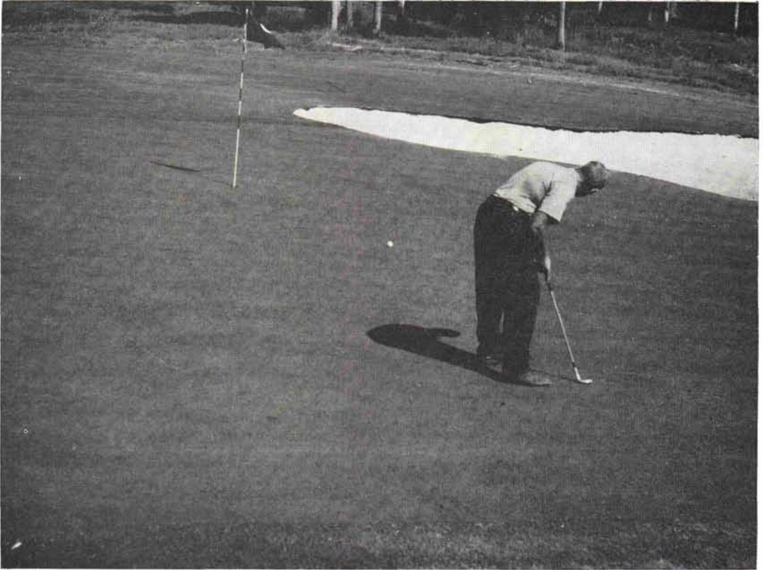
Low handicappers like the fast, true roll of the ball when Tifdwarf greens are managed properly.