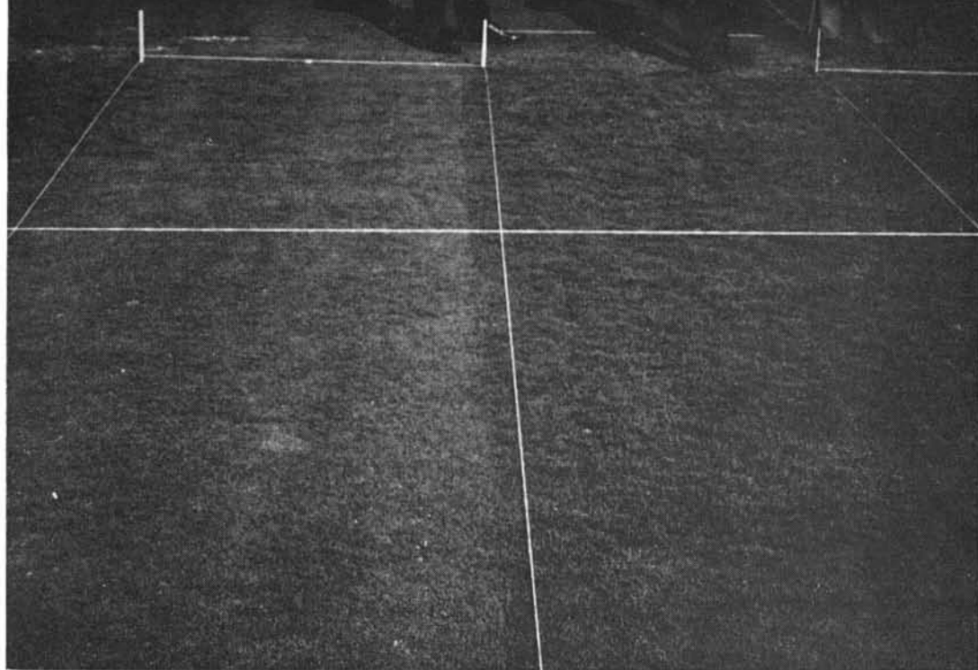
Tifdwarf (left) is gaining with the home owner. There's less mowing to be done.