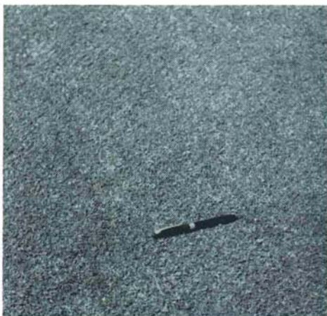
A putting surface which has just been vertically mowed. Note the fine, parallel grooves. After mowing with a putting green mower, this green may be temporarily off color but it will be "truer" and more nearly free of grain than before.

Topdressing, applied over a thatch in too heavy amounts, will create organic matter layers with the attendant difficulties. Topdressing, however, is one of the chief tools to be used in the prevention as well as in the elimination of thatch. Topdressing is best used in conjunction with aerification or cultivation. Holes or slits