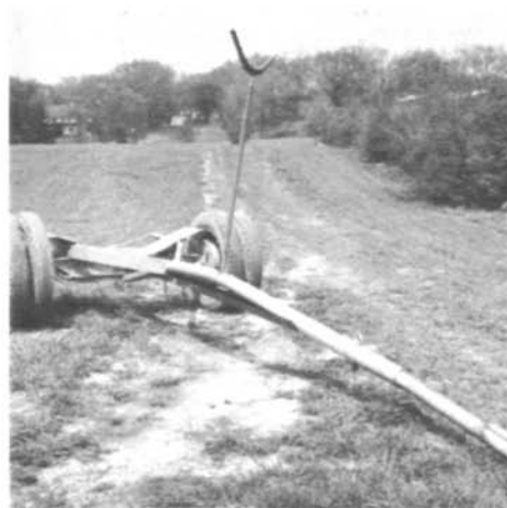
1. A view of the implement which is made of angle iron, pipe, and a dual wheel axle.