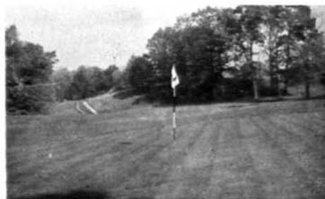
4. A view of No. 14 green ten days after the resodding operation.

As soon as the sodding job is completed, the green should be rolled several times with a large diameter hand roller