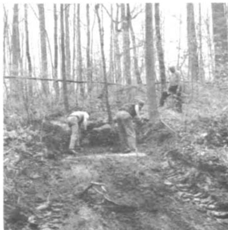
2. The rough digging is done by a front end loader or backhoe. A minimum of fine work with pick and shovel is required. The tree is selected from the wooded area on the course.