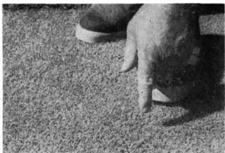
Gentle pressure with foot firms repair and levels surface, for the benefit of all who may putt on the green in the future.