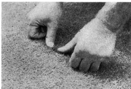
The thumbs often can be used to advantage in working broken turf together after it has been loosened and lifted.