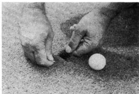
One hand holds "flap" while other, using tee, lifts soil and pulls turf from opposite side of ball mark.