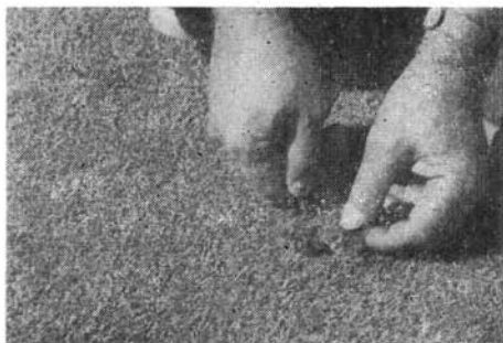
Wooden tee can be used to pry up "flap" and loosen soil which has become compacted by force of the ball.