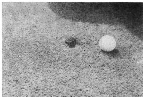
Ball mark on a creeping bentgrass green. If not repaired, the grass will turn brown and bumpy putting will be the result.