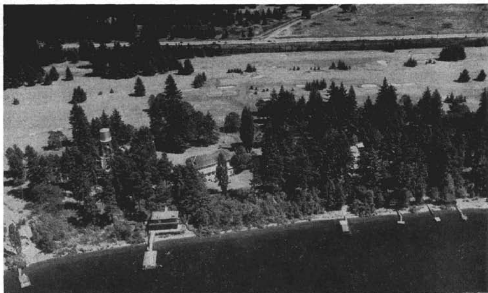
The course and clubhouse of the Tacoma Country and Golf Club on American Lake