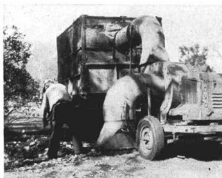
Power machine removes windrows and piles of leaves with suction so powerful that mass of leaves comes out almost as a bale.