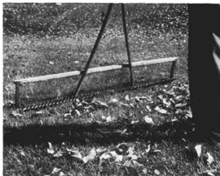
Wooden fingers of this hand rake lift leaves out of the grass, and wire-screen backstop holds them until windrow is reached.