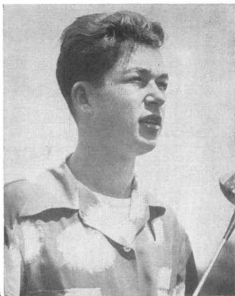
Kenneth P. Venturi