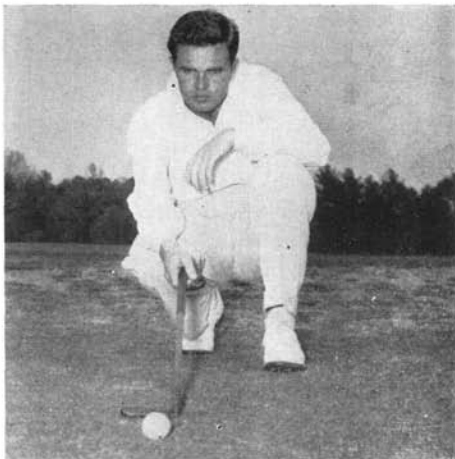
Harvie Ward, Jr.

open tournaments. Tied for second in 1947 British Open.