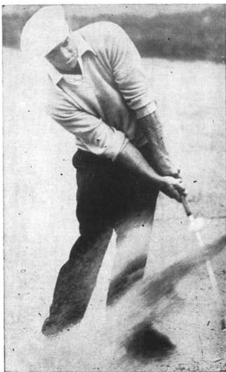
Frank R. Stranahan