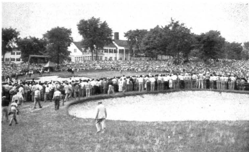
OVATION AT THE 18th. Hogan arriving at the last green with thousands banked around. He may be seen, cap in hand, in exact center.