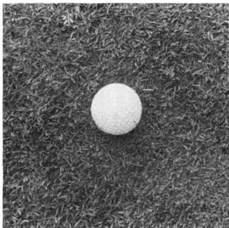
Tifton No. 57 Bermudagrass. Sod is dense and weed-free, has fine texture.