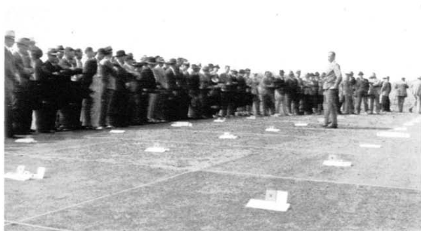
The Greenkeeping Superintendents reviewing a portion of the series of plots established on the Arlington Turf Garden to test the value of various combinations of fertilizers in the maintenance of bent turf. The plots were marked with cards showing graphically the relative amounts of nitrogen, phosphoric acid, and potash which they had received, as well as with the names of the materials used and the pH of the surface 2 inches of soil at the time of the meeting.

the most disease resistant turf. C-52 and C-19 were also resistant but to a lower degree. Later in the day when plots of some of these same strains were shown growing in a low pocketed area, it was seen that some of them which produced superior turf on the Turf Garden with its better air circulation did not do so well under such adverse conditions. In this area, the