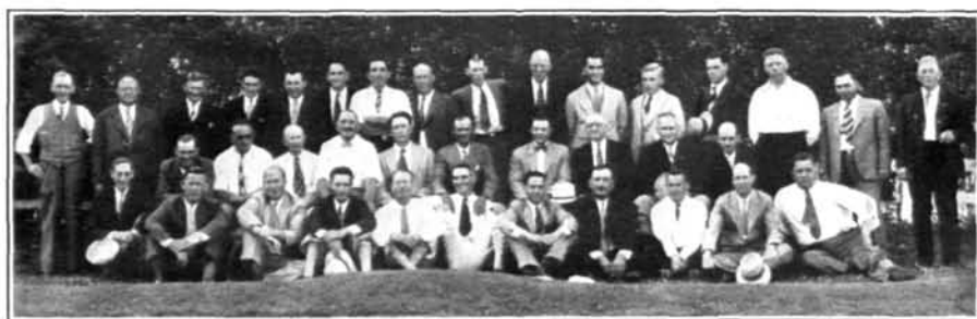
Philadelphia Association of Golf Course Superintendents