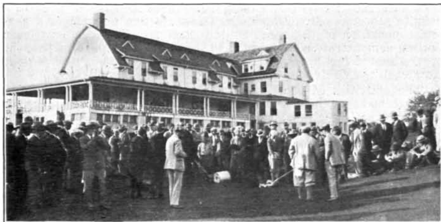
Hardly anything can compare in interest with a meeting on a golf course, where greenkeepers and committee members may get first-hand information on turf practices and the use of equipment. Green Section and Supply Section of Metropolitan Golf Association.

The beginning of the Metropolitan Golf Association Green Section dates back to June 23, 1925, when a special meeting of the Metropolitan Golf Association was called to consider and vote on a plan for the organization of a service bureau for golf clubs in the Metropolitan district. This meeting was attended by nearly 100 delegates, and after a discussion these delegates endorsed the idea of a service bureau and referred the matter to the executive committee with power to act. The purpose of the service bureau, as stated at that time, was primarily to help in the purchase of implements and materials and to distribute information and advice with regard to the maintenance of golf courses. The expense of this service was to be borne by a fee of $100 to be paid by each particular club. Twenty-two clubs applied for membership, and a headquarters was established at 2 Rector Street, New York City.