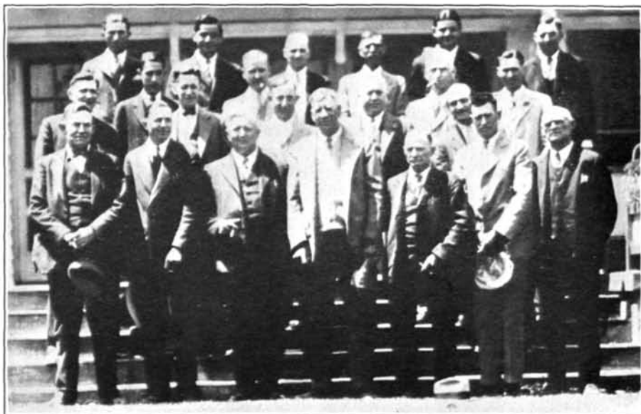
A meeting of the Indiana Greenkeepers' Association

Our association was organized in 1928 with 22 charter members. Its membership is now 35. Greenkeepers and assistant greenkeepers on Indiana courses are eligible for membership provided they have had at least two years of actual experience. The annual dues are $5. Meetings are held monthly at the various clubs with which the members are associated. Inspection of the course is made at the meeting, followed by a luncheon and a general discussion. The green committee of the club at which the meeting is held is always in attendance. At our meeting in October, 1930, which was held at the Christiana Country Club, at Elkhart, we held our annual tournament. The winter meetings are held at Hotel Lincoln, in Indianapolis. During 1930 twelve regular meetings were held.