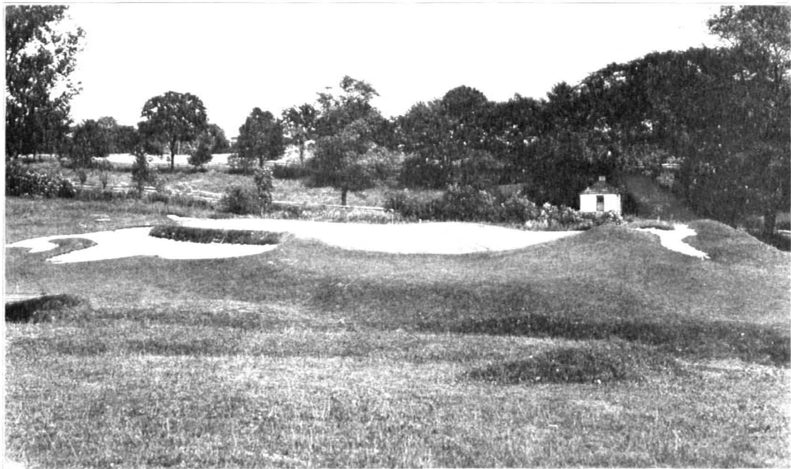
Hole No. 17, Merion Cricket Club. Close up View of Putting Green.