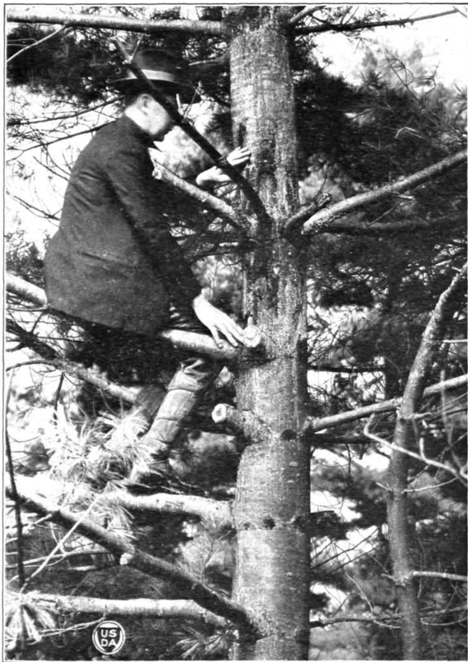
Trunk of a large white pine girdled by the blister rust 22 feet from the ground. This tree is nearly dead, and many of its branches are dead or dying from the disease. Some of the branches show the blisters bursting through the bark.

in growth, bushy in appearance, and often of a faded yellow color. A twig here and there may be dead, and close examination will probably show the presence of many cankers on the stem and branches. Large white