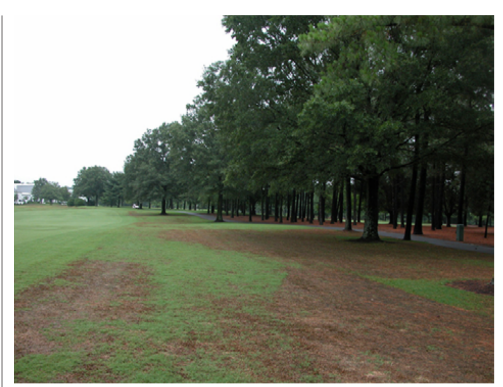
Bermudagrass performs poorly in shade and is much more susceptible to wear injury and winter damage in the absence of sufficient sunlight.

USGA agronomists began helping courses develop tree-management programs in the late 1980s, and many articles were written and presentations were made on the subject. The path to helping courses identify and solve tree problems was paved by education. Courses began to address tree problems, but only grudgingly at first. Many golfers feared that removing trees would make their courses "too easy" and look barren. Many golf courses