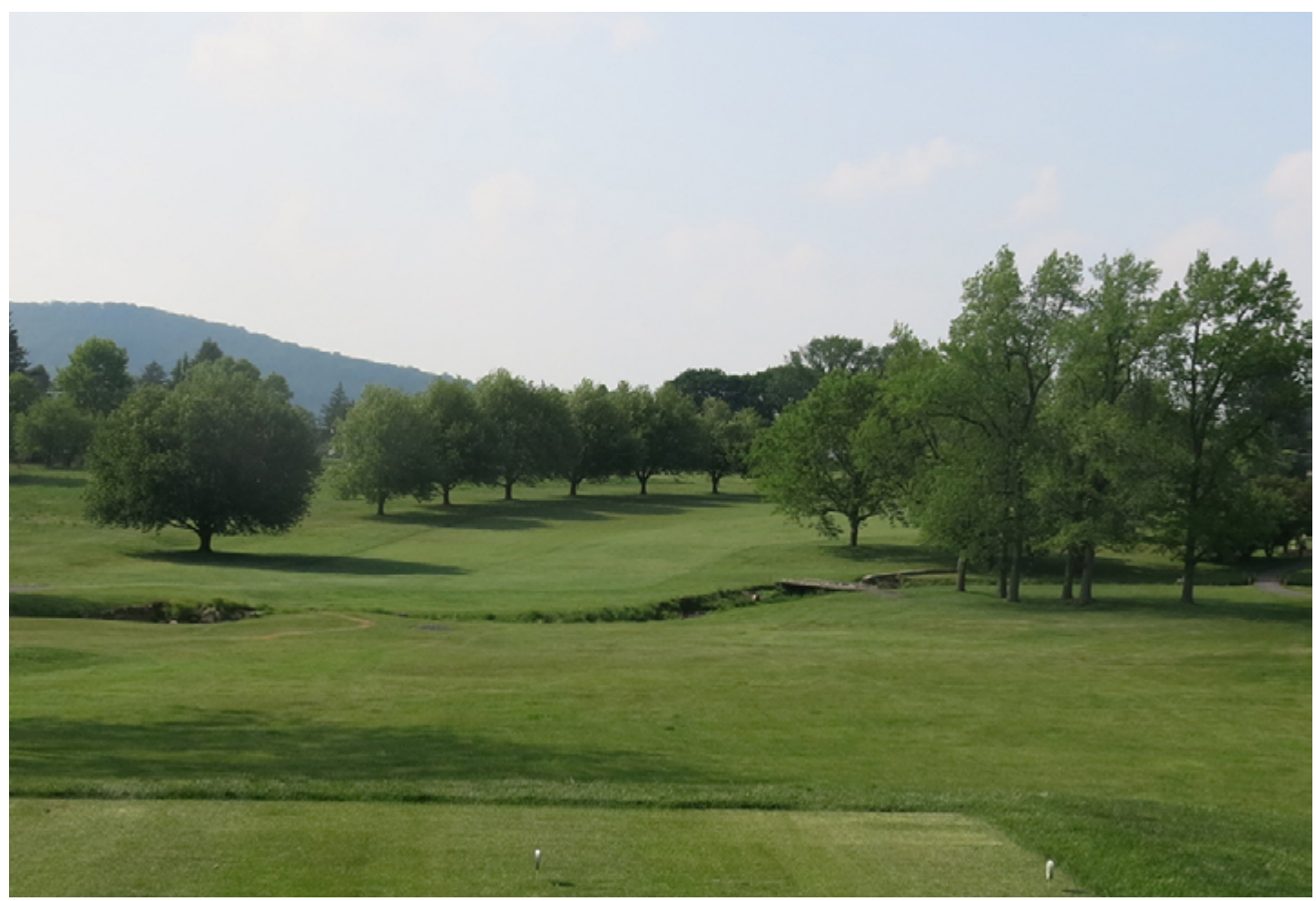
The unnatural tree line on the left side of this hole was added years after the course was built. It effectively shifted the center of the fairway to the right by 10-15 yards, it looks odd, and it penalizes a well-struck drive. More important, it influences play to the right towards an adjacent tee. If trees are to be used on the left side of this golf hole, they should be well left of their current location.

the shot to the green is much more difficult to judge with accuracy than it would were there a tree or two standing forth. All players of ability will bear witness to the baffling length to a naked green, but few actually realize how much more readily the estimate of the eye would be flashed to the brain if sight should fall simultaneously on a lone tree and its neighboring green." Isn't it ironic that golfers still claim to need a backdrop when yardage aids now are so common?