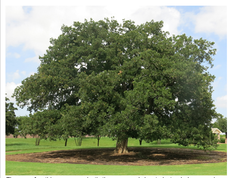
There are few things more majestic than a properly located, stand-alone specimen tree. It is remarkable what a small tree can become with care and foresight.

Poorly located trees forced golf holes out of alignment by narrowing playing corridors and reducing lines of play. Golf holes that were originally intended to provide golfers with multiple lines of play became so choked with trees that often only one option