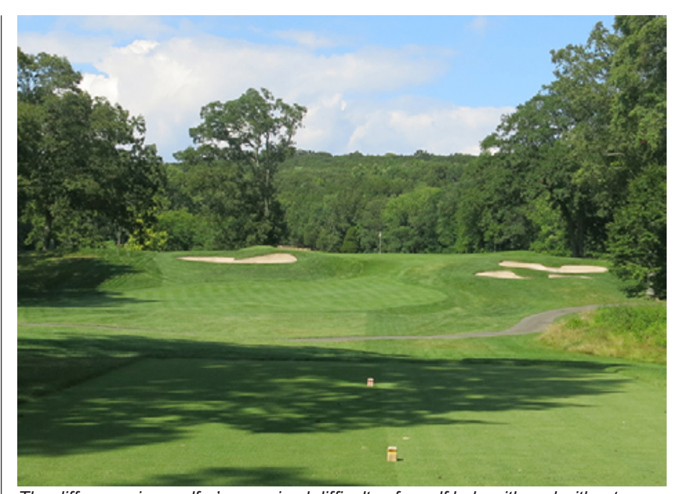
The difference in a golfer's perceived difficulty of a golf hole with and without a backdrop of trees is remarkable. Once a backdrop is removed, a green looks smaller, the topography comes alive and the hole looks much more challenging.

Several famous golf course architects commented or wrote about trees. The following A. W. Tillinghast quote, from the book titled The Course Beautiful , encapsulates his opinion of trees used as backdrops behind greens: "... in the case of a green played directly beyond the slope of a hillock and sharply defined against the sky. Barren of any nearby object, such as a tree for instance, the distance of