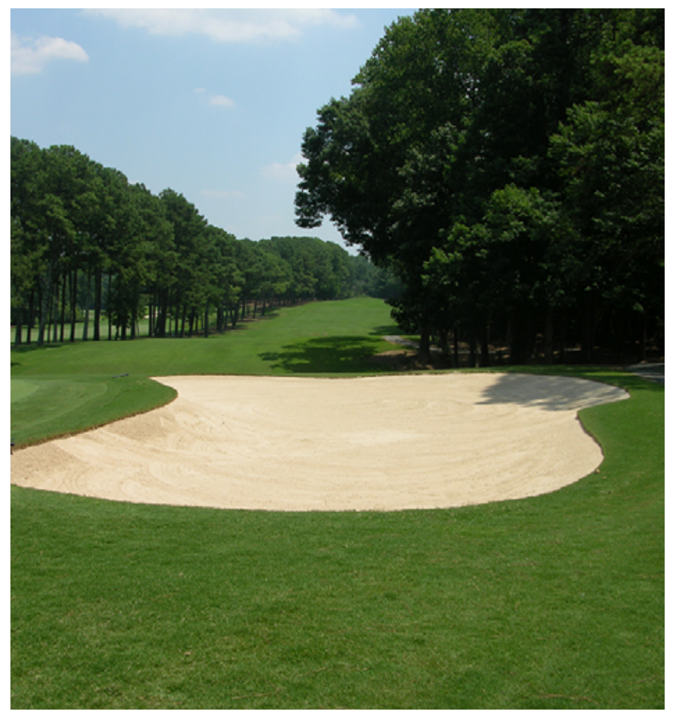
Trees that block advancement from a bunker doubly penalize a miss-hit shot and are termed "double hazards." For most, golf is a difficult enough game and to penalize a wayward shot so severely just adds insult to injury.