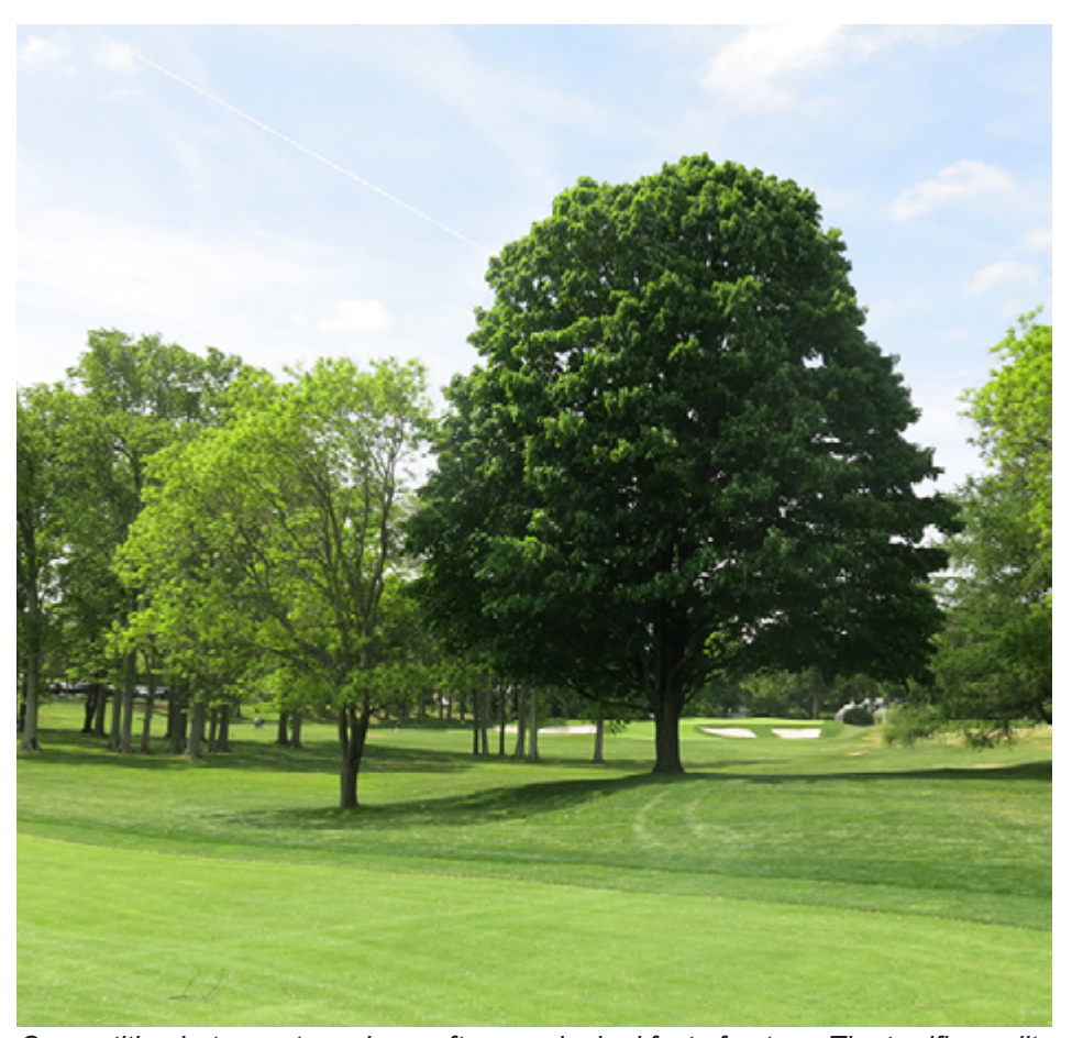
Competition between trees is an often overlooked fact of nature. The terrific quality sugar maple on the right will be ruined if the more recently planted locust on the left is not removed. The choice is simply a matter of quality vs. quantity. Unfortunately, all too often quantity wins.

choose tree species wisely when developing a tree-management program for a specific location. There always are exceptions, but usually it is wise to rely on tree species that are indigenous to your geographic area because they are more likely to perform well. Observing which tree species are performing well on your course or in the surrounding area also can provide valuable clues as to what trees might be successfully used at your facility. It is extremely important to consider longevity, diversity, and susceptibility to disease and insect pests when selecting tree species. Major pest or disease outbreaks can occur with little warning, severely affecting susceptible tree species. Dutch elm disease decimated American elm tree populations years ago, and golf courses and communities that had large populations of American elms were devastated. Similar effects