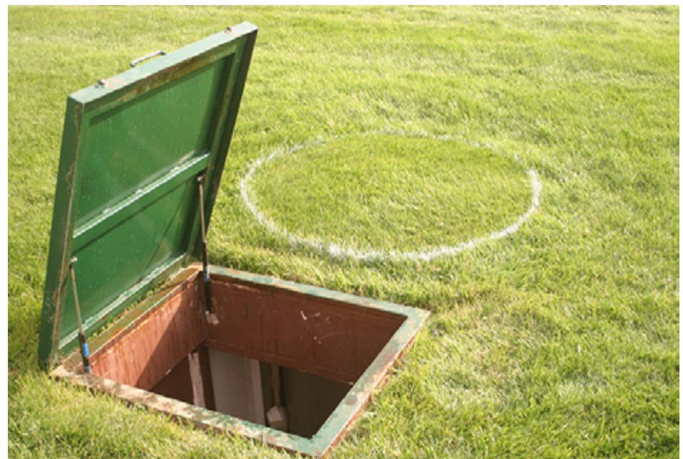
Lysimeters were installed at the Michigan State University Hancock Turfgrass Research Center from 1989 to 1991. Plots have been continuously fertilized for 21 years, and leachate has been analyzed for nitrate-nitrogen since 1998. Leachate analysis revealed that levels of nitrate-nitrogen in the leachate can be reduced by lowering the application rates of nitrogen fertilizers, but such leachate reductions may take five years or more before acceptable levels are achieved.

Nitrogen mineralization is the process by which nitrogen that is incorporated into organic matter (plant roots and shoots, soil microorganisms, thatch, etc.) is converted back into inorganic nitrogen. When plants, animals, and soil fauna and flora die, the decay process releases organic nitrogen as ammonium ( \text{NH}_4^+ ). Plants can absorb the ammonium again or