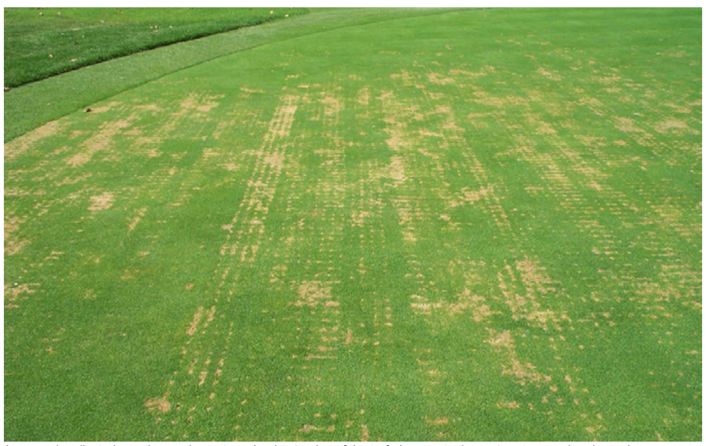
Improperly adjusted aeration equipment can lead to tearing of the turf, damage to the root system, and prolonged recovery.

ore aerating putting greens is a lot like going to the dentist. We know it is necessary a few times each year, but we hope the experience is as quick and painless as possible. Although core aeration temporarily diminishes putting quality, the shortlived pain results in a long-term gain for turf health by reducing thatch and organic matter levels, relieving soil compaction, increasing soil oxygen levels, and stimulating healthy root growth. Golfers begrudgingly understand these benefits but wonder why it sometimes takes so long for putting greens to recover. Core aerating greens will always result in some disruption, but there are steps that can be taken to help the greens recover as quickly as possible.