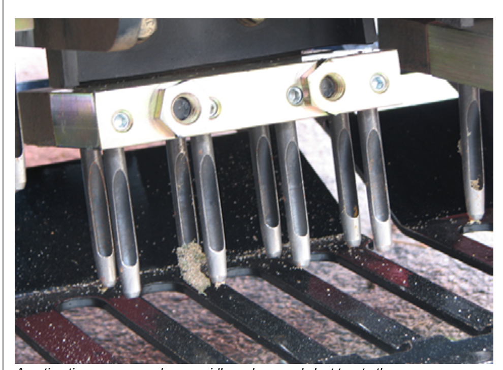
Aeration tines can wear down rapidly and may only last two to three greens. Having several extra sets of coring tines and checking the equipment frequently throughout the process helps to ensure that maximum benefit is gained from the aeration process.

7. Avoid excessive turf abrasion when incorporating sand into aeration holes — Typically, a steel drag mat, brushes, or brooms are used to push sand into aeration holes. Dragging or brushing should be performed only to the point where sand has filled