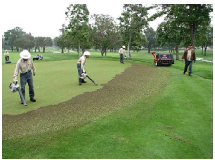
The use of handheld blowers is a useful technique to clear aeration cores and debris from the green in preparation for sand topdressing.