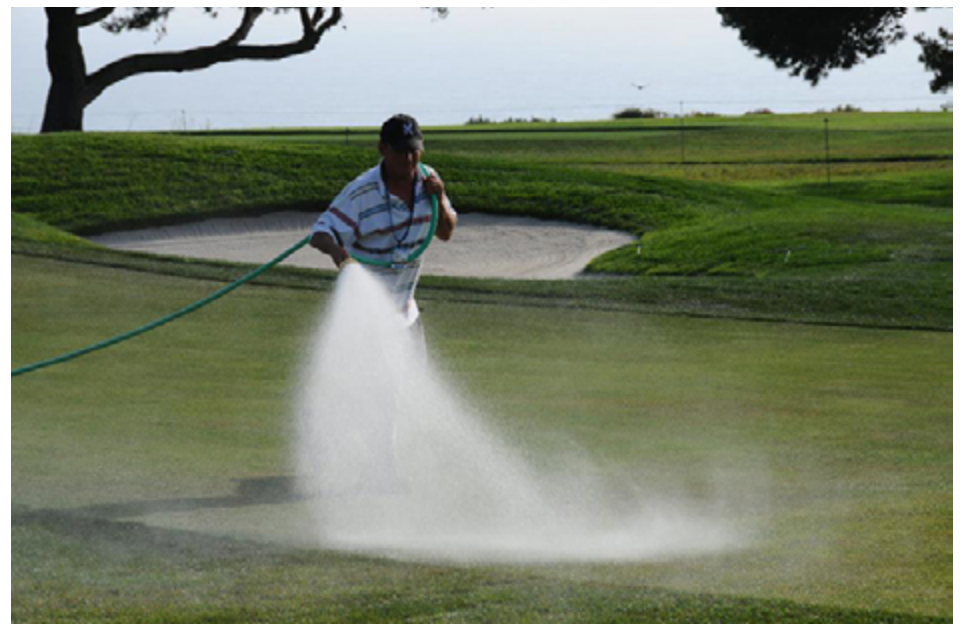
Frequent irrigation and supplemental hand watering throughout the day for several days are typically necessary to stimulate turf recovery and prevent aeration holes from drying out too quickly.

its energy to producing new roots and leaves to fill the voids. Worn and jagged coring tines tear the turf and contribute to desiccation along hole edges, which slows recovery. The equipment should be checked and tested at least a week in advance to verify that adjustment and timing of the machine are correct and to insure that a clean vertical hole is created. Aeration tines wear down rapidly and may only last for two to three greens. The superintendent and mechanic should monitor the equipment closely throughout the aeration process so that the coring tines can be changed promptly.