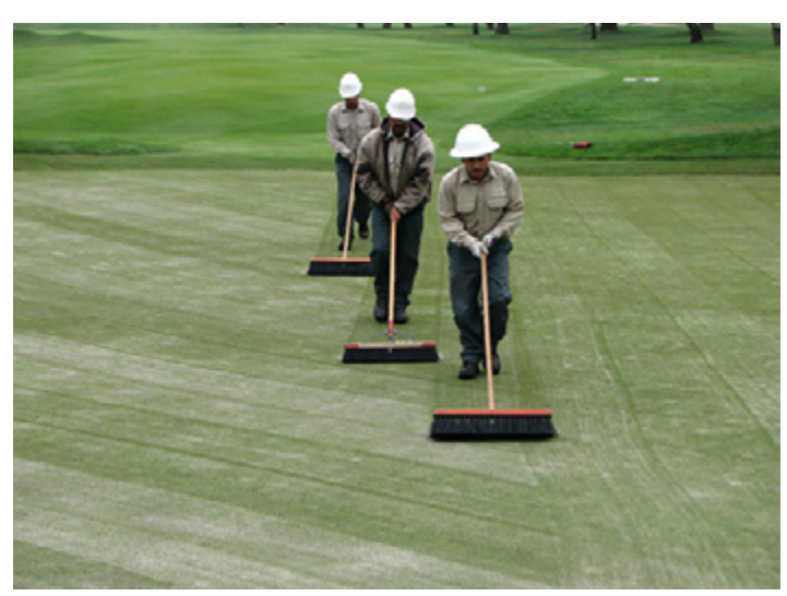
Push brooms are one of many methods used to fill aeration holes with sand while causing less damage and abrasion to the turf.

There are dozens of methods superintendents use to aerate greens, the most popular being ½-inch-diameter hollow tines, commonly referred to as conventional coring, but there are also small, pencil-sized hollow tines, highpressure injection of water and/or sand, large-diameter drills, and many others involving tines, knives, or blades of varying shapes and sizes. Each procedure has its own benefits, and it should be up to the superintendent to decide which method is best based on the prevailing climate, conditions, and aeration goals for a particular golf facility. For the purpose of this article, only the standard practice of core aeration using 1/2-inch-diameter hollow tines or larger will be discussed, along with 10 useful tips to get the maximum benefit from the procedure and restore smooth putting surfaces as quickly as possible.