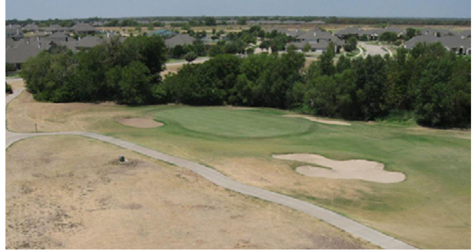
Putting green complexes typically encompass 4 to 6 percent of the total golf course area, and continuing to irrigate these areas helps to maintain acceptable playing quality while using relatively little water.

©2013 by United States Golf Association. All rights reserved. Please see Policies for the Reuse of USGA Green Section Publications. Subscribe to the USGA Green Section Record.