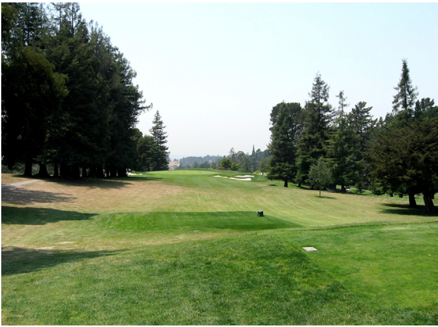
During a drought emergency, putting green complexes and teeing grounds typically receive the highest priority for irrigation, while the rough receives the lowest priority.