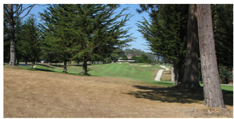
During a drought emergency, the greatest amount of water saving will be achieved by reducing water applications on larger areas of the property, such as the rough.