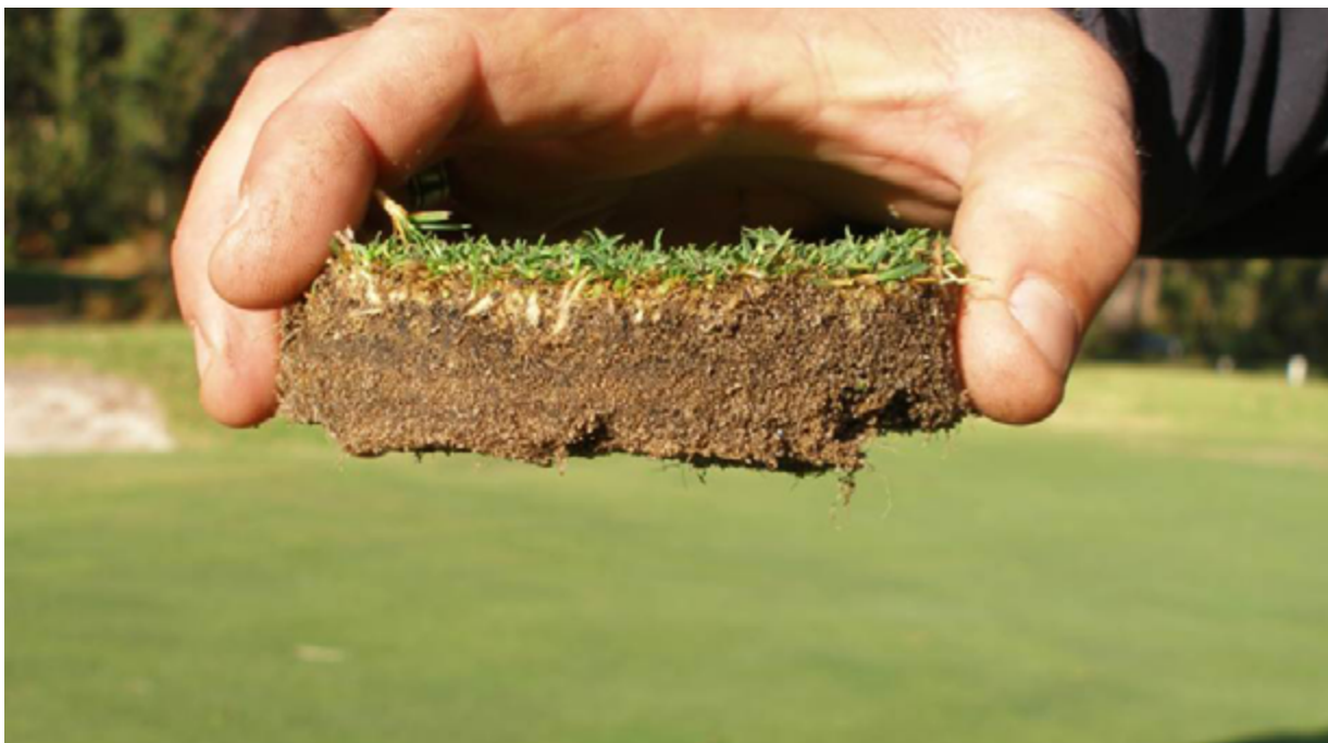
Figure 6. Roots damaged by nematodes may appear cropped just below the thatch layer.

nematode-damaged root system can result in: