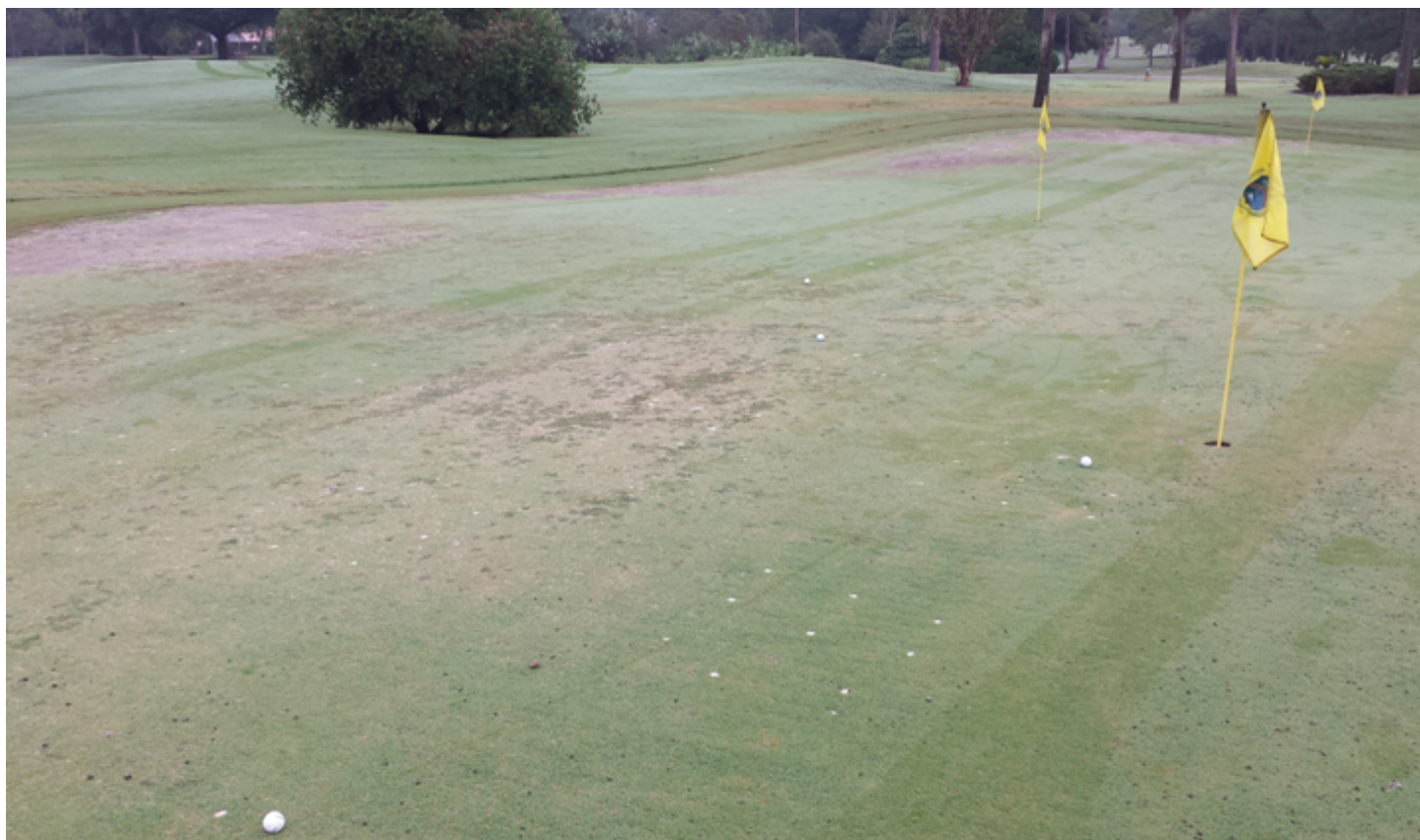
Figure 4. An ultradwarf bermudagrass putting green infested with lance nematodes exhibits thinning, decline, and a proliferation of weeds.

Further complicating the idea of nematode thresholds, nematodes often interact with other turf pathogens. However, the extent to which these organisms interact is largely unknown. It may take 50 nematodes per 100 cm 3 of soil to cause direct damage, but it may only take 20 nematodes to make the turf susceptible to disease. There-