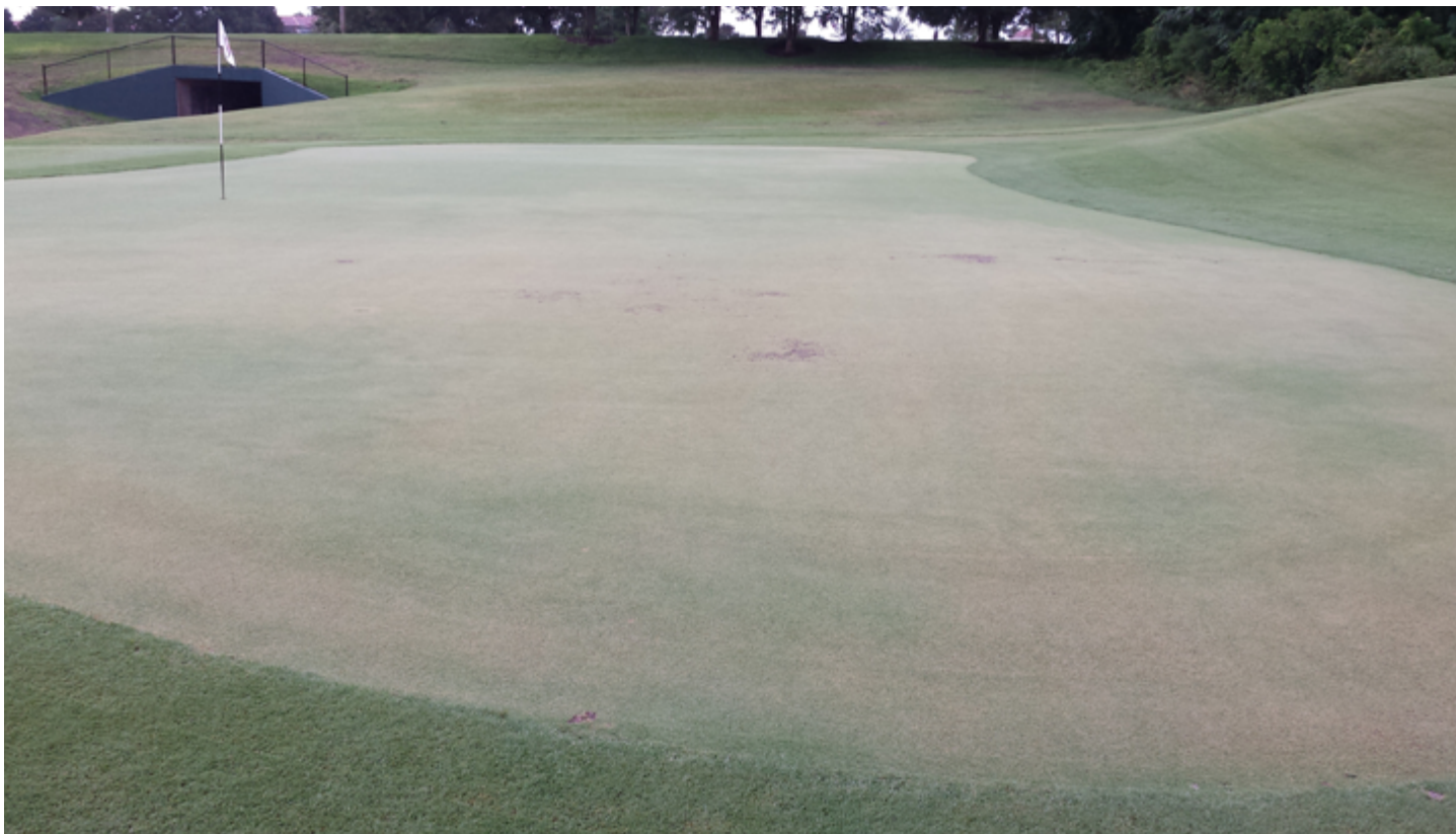
Figure 1. This recently renovated ultradwarf bermudagrass putting green is infested with sting nematodes.

N ematodes were once considered a problem that only affected golf courses in the southeastern United States. Now, however, there is increasing concern about nematodes among golf course superintendents nationwide. Are nematodes really becoming more of an issue and, if so, why? Should you be concerned? How can you tell if nematodes are a problem at your golf course?