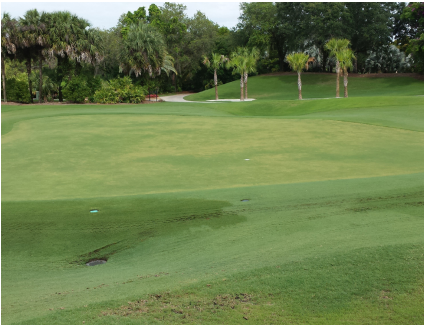
Figure 5. An ultradwarf bermudagrass putting green infested with root-knot nematodes may exhibit yellow blotches.

fore, nematode counts and thresholds should not be relied on as the sole factor in determining whether to apply a nematicide.