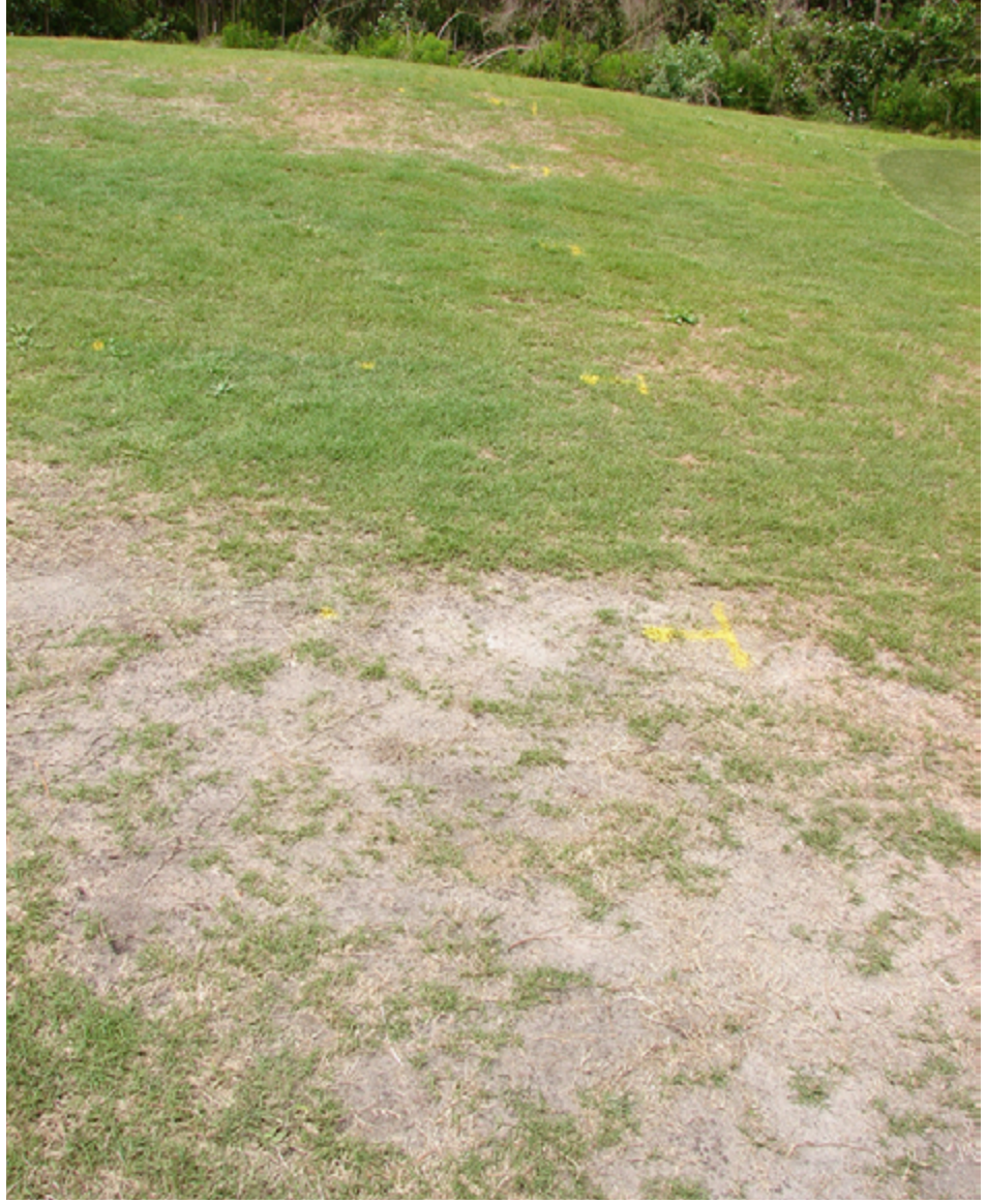
Image 4. As damage continues, the bare spots expand and coalesce, creating a large area of bare soil. The damage appears to be most severe on slopes where water distribution is not even.

becomes necessary. Dr. David Shetlar and Dr. Harry Niemczyk of The Ohio State University developed a sampling protocol for the bermudagrass mite. A 3- x 4-foot rectangular frame is constructed with PVC pipes. Inside the frame, strings are threaded through holes drilled into the PVC pipes at 1-foot intervals, creating 12 grids. The frame is then placed onto infested turf and the total number of witch's brooms in 10 of the 12 grids is counted. Samples should be taken once a month from every 50 feet on fairways and roughs, four frame samples from each green approach, and two frame samples from each tee bank. If four or more