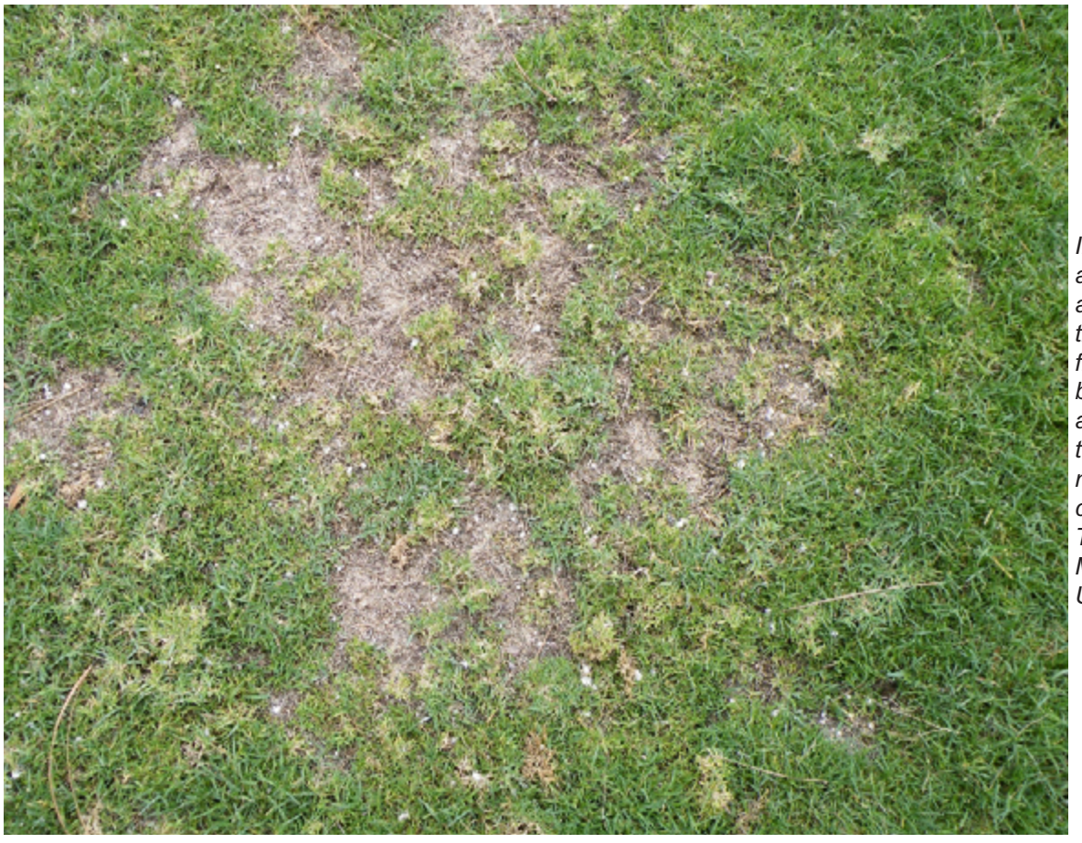
Image 3. As stunting and death of stems and stolons continue, the turf fails to recover from the damage and bare spots begin to appear. The stunted tufts are quite noticeable.

insects). The bermudagrass mite is whitish cream in color or translucent, as seen in Image 2. A large number feed under the leaf sheath, causing stunted internodes and a typical witch's broom symptom (Image 1). Because of their small size, color, and habit of feeding under the leaf sheath, individual bermudagrass mites are extremely difficult to see even with a hand lens. The witch's broom damage is a more reliable diagnostic characteristic.