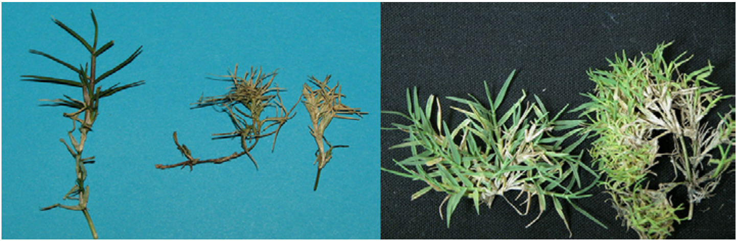
Image 1. Infestation by the bermudagrass mite stunts stem growth in common and hybrid bermudagrass, causing the characteristic "witch's broom" symptom in stem (left) and the entire tuft (right).

As an entomologist and extension specialist, I usually have recommendations (if not solutions) to most insect problems. But for the past few years, the bermudagrass mite, also known as the bermudagrass stunt mite, has severely bruised my ego.