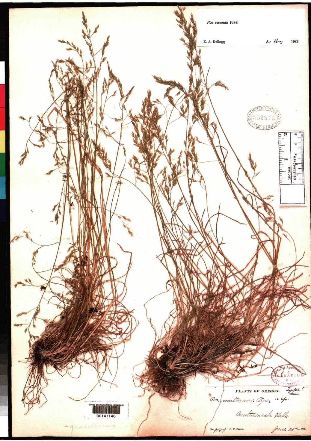
Piper collected Poa multnomae (now P. secunda Presl. ) in 1904 at Multnomah Falls in the Columbia River Gorge. It is housed at the National Herbarium, along with numerous other plant specimens collected by Piper.

the Green Section to survey local conditions at golf courses. Unfortunately, it was impossible to comply with all of these requests, but where opportunity permitted, the courses were visited and consultation freely granted."