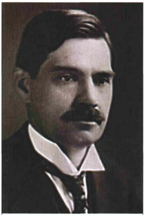
Charles Vancouver Piper

"My alpenstock and the whole ice bridge fell into the crevasse," remembered Piper in 1915. "I have often wondered what would have happened if I had attempted to go across the bridge in the ordinary way."