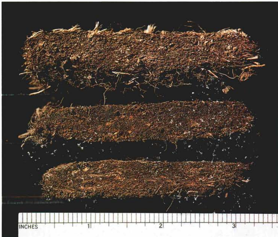
Cross-section comparisons of an original thatch piece (top) and thatch recovered from medium (center) and fine (bottom) mesh bags, 23 months after burial. Decomposition was minimal in the absence of earthworms in the fine mesh bag.